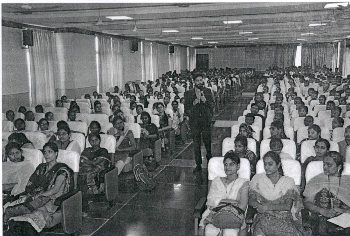
BEC Training Session on 13 February 2019